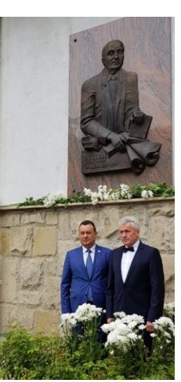
ASE at the European Researchers' Night 2018

On September 28-29, 2018, The Bucharest University of Economic Studies participated in the European Researchers' Night events. ASE's representatives organized at the University's headquarters in Romană Square and at the exhibition stand in University Square an exciting and varied program, comprising presentations, demonstrations and workshops on: the results of research conducted by academic staff members, undergraduate, graduate and Doctoral students, as well as research topics suggested by the business environment; means of avoiding plagiarism in academic writing; simple ways to improve the quality of the environment; managerial games used in teaching etc. Interested participants were offered a guided tour of the Palace of The