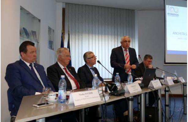
Start of the Campaign entitled "With a helpmate's paw, our learning's without flaw!"

During January 22 - February 12, 2018, ASE's students are on their exam session. On this occasion, the Academy of Hope, in partnership with the "Utility Dogs' Club" Association in Bucharest, are organizing the Campaign entitled "With a helpmate's paw, our learning's without flaw!", as part of the project entitled – "Academy of Hope – Volunteering out of