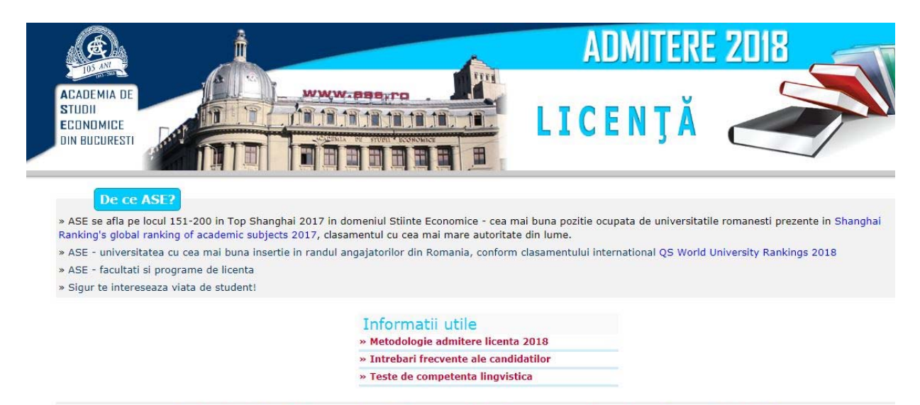
Academia de Studii Economice din Bucuresti in clasamente universitare de prestigiu din lume