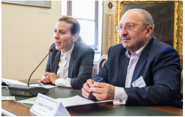
"International Conference on Security for Information Technology and Communications" - SecITC 2018

On November 8-9, 2018, The Bucharest University of Economic Studies hosted the 11<sup>th</sup> edition of the "International Conference on Security for Information Technology and Communications" – SecITC 2018. The event reunited researchers in Cybersecurity,