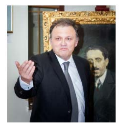
HE Prof. Lino Bianco , Ambassador of the Republic of Malta in Romania and Bulgaria

On February 21, 2017, HE Prof. Lino Bianco , Ambassador of the Republic of Malta in Romania and Bulgaria, visited ASE. On this occasion, the distinguished guest delivered the Conference entitled "The Maltese Presidency of the council of the EU". The following issues were debated with the audience: migration, the single market, security, social inclusion, the European neighborhood policy and maritime policy.