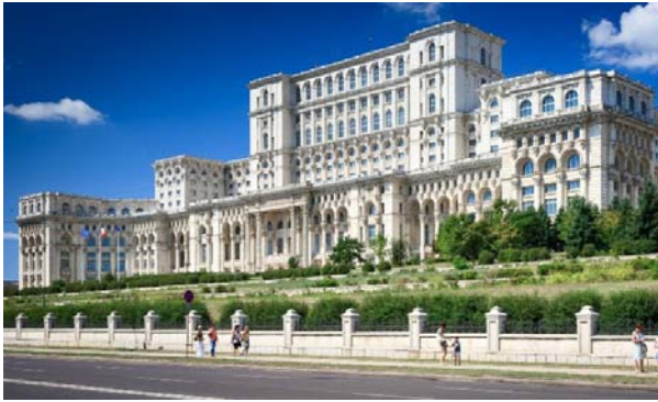
Palace of the Parliament